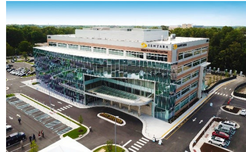
Sentara Brock Cancer Center 6251 E. Virginia Beach Blvd. Norfolk, VA 251,183 SF