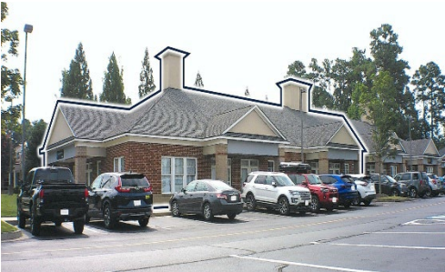
Dental/Medical Office 11531 Nuckols Road Glen Allen, VA 9,702 SF