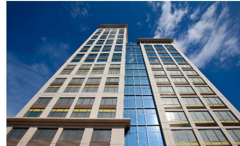
Wells Fargo Center 440 Monticello Avenue Norfolk, VA 255,000 SF