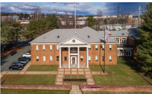
Landmark HQ Office Building 2000 Holiday Drive Charlottesville, VA 27,000 SF