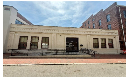
Historic Office Building 2217 E. Franklin Street Richmond, VA 6,490 SF