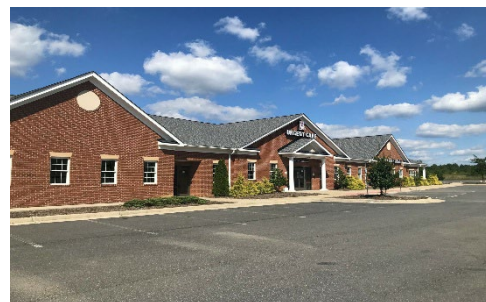
Belmont Professional Office Rogers Clark Boulevard Ruther Glen, VA 11,160 SF