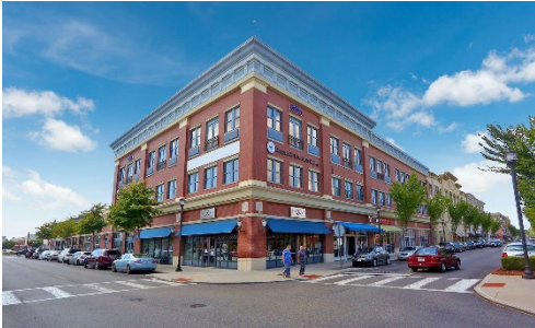
Peninsula Town Center 4410 E. Claiborne Square Hampton, VA 98,259 SF