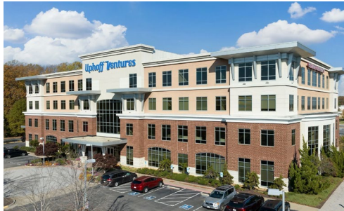
Class A Office Space 15521 Midlothian Turnpike Midlothian, VA 78,000 SF