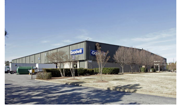
22,600 SF – BreakThru Beverage Virginia Beach, VA