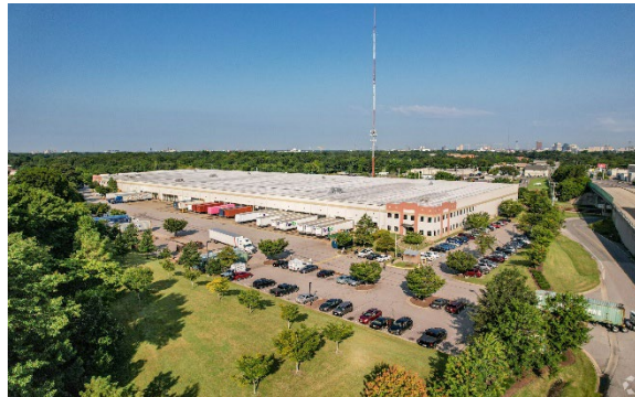
72,558 SF – Comm. Test Design, Inc. Chesapeake, VA