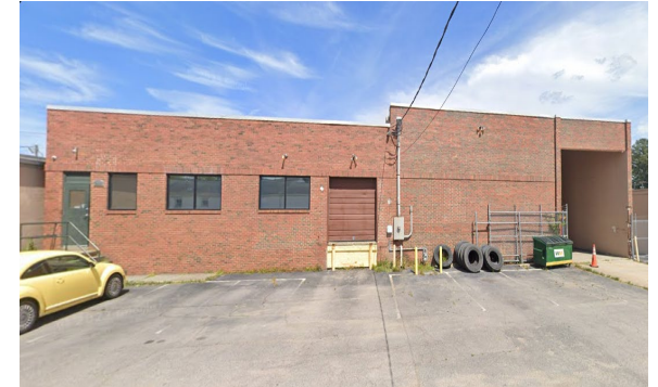
7,600 SF – Stanley's Home Furnishings Norfolk, VA