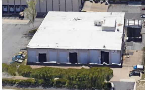
23,400 SF – Winsupply Virginia Beach Virginia Beach, VA