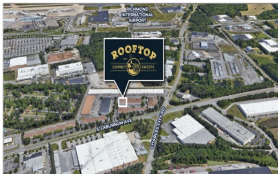
4,880 SF – Rooftop Chimney Sweeps Richmond, VA