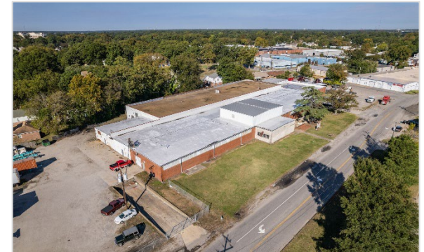
14,662 SF – A & J Trucking Repair, LLC Portsmouth, VA