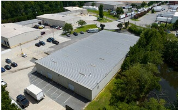
20,000 SF – CDA-USA Richmond, VA.