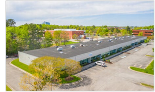
7,885 SF - Security Technology Group Chesapeake, VA