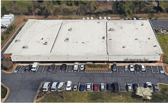
3,389 SF – Monument Foods, Inc. N. Chesterfield, VA.