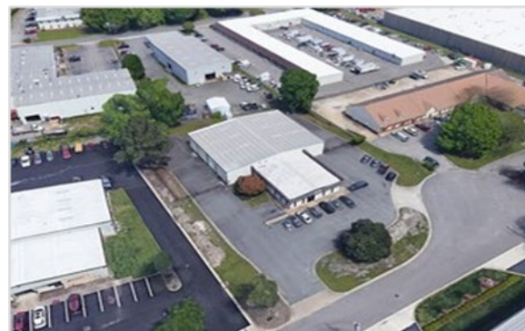
10,850 SF – Sylvestor's Dock & Door Chesapeake, VA