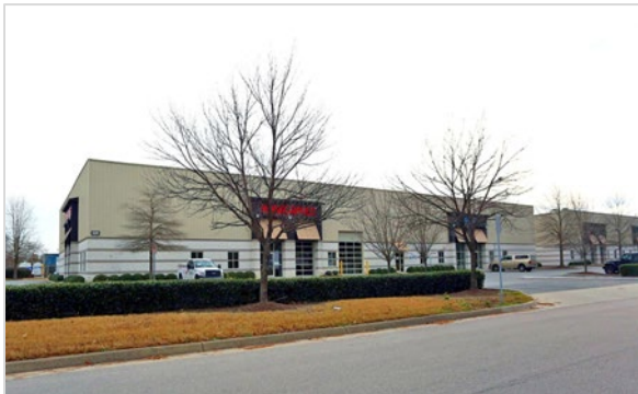
9,160 SF – LANDSEA, LLC Chesapeake, VA.