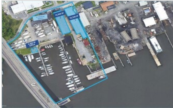
12,000 SF – Blast One Int'l Portsmouth, VA