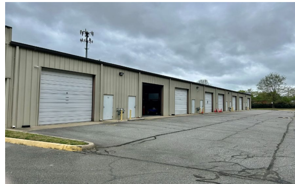
4,939 SF – ARC 3 Virginia Beach, VA