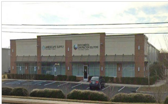
20,000 SF – Landscape Supply, LLC Virginia Beach, VA