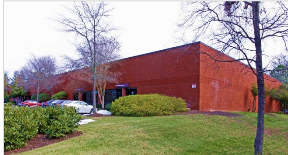
10,000 SF - Commonwealth Rest. Spec. Richmond, VA