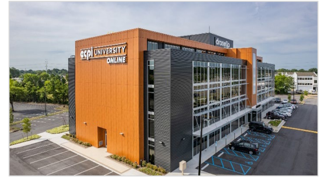
7,273 SF - DeVito & Martin Optometry Virginia Beach, VA.