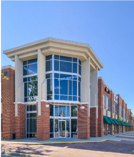
5,490 SF - Counseling Center of Hampton Roads Virginia Beach, VA.