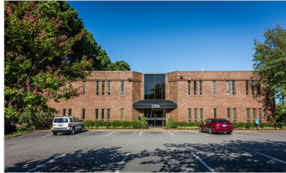
1,903 SF - Eimskip Logistics, Inc Virginia Beach, VA.