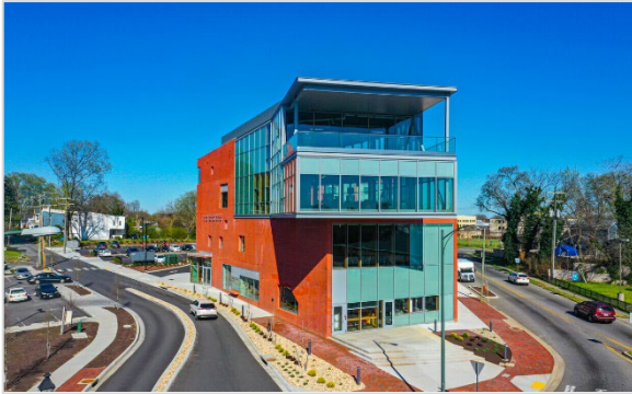
10,935 SF - Sodexo Operations Richmond, VA.