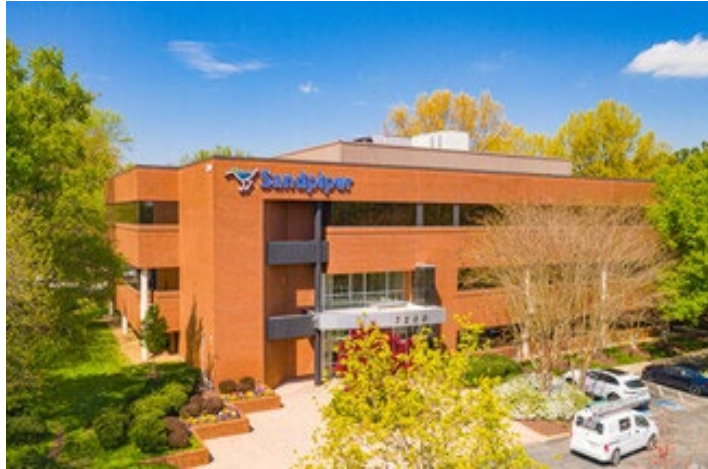
7,737 SF - S.L. Nusbaum Realty Co. Richmond, VA.