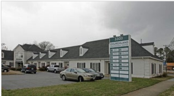
2,167 SF - All Support Portsmouth, VA