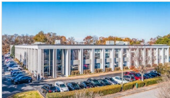
3,116 SF - Integrated Healing Solutions Norfolk, VA.