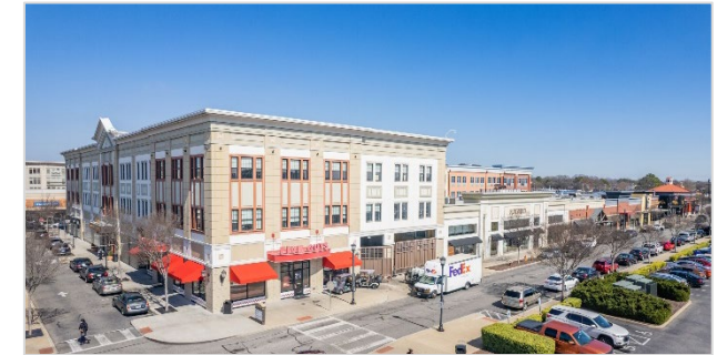
2,635 SF - Arisa Medical, LLC. Hampton, VA