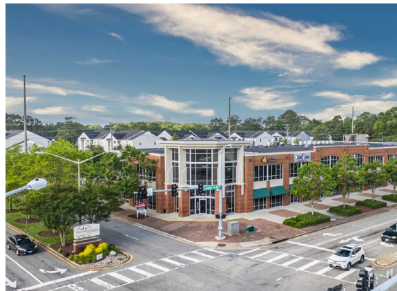
3,280 SF - HR Pediatric Dentistry Virginia Beach, VA