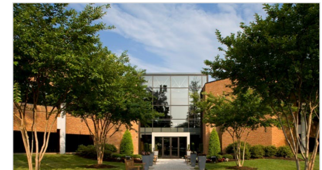
5,838 SF - Wellspring of Hope, LLC Glen Allen, VA.