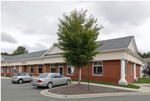
2,353 - State Farm Insurance Henrico, VA