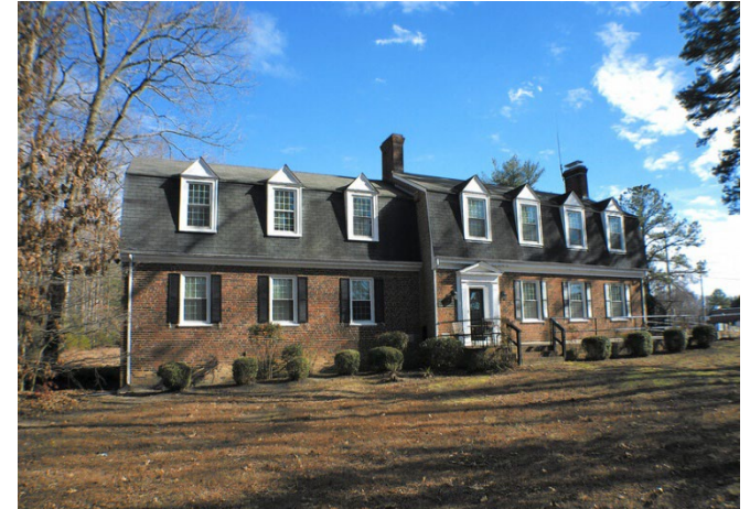
4,104 SF - Devoted Family Solutions Chester, VA