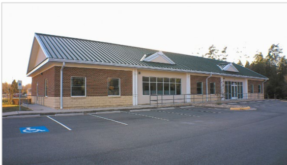
5,500 SF - Spiritos School Powhatan, VA.