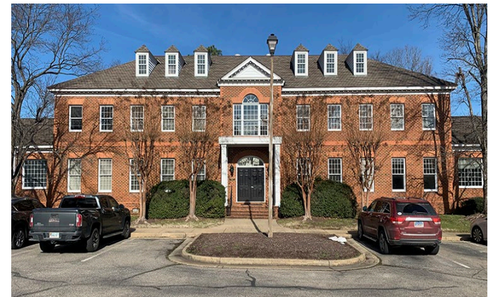
3,600 SF - Building Blocks LLC Richmond, VA